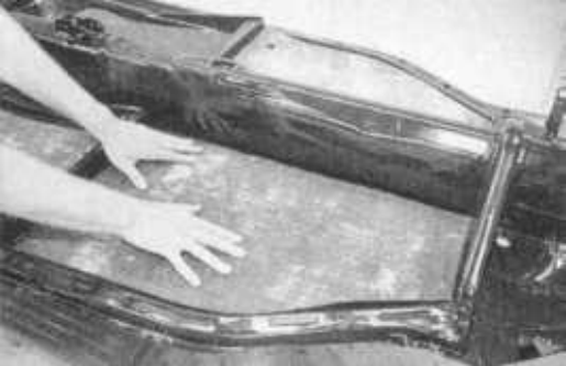
ABOVE , once the brake lines were replaced, new tar boards from Chuck's Convertibles were positioned and glued into place. BELOW , all-new cables, transmission mounts and rubber items were replaced, thanks to W.C.M. and Small Car Specialties.