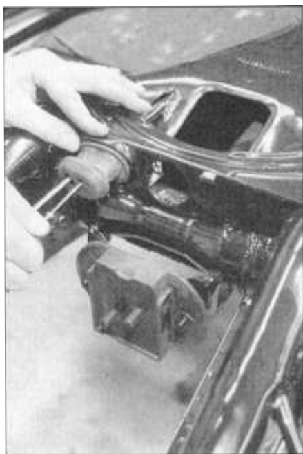
ABOVE , to fully update our floor pan, West Coast Metric was called upon for all of the replacement rubber parts.